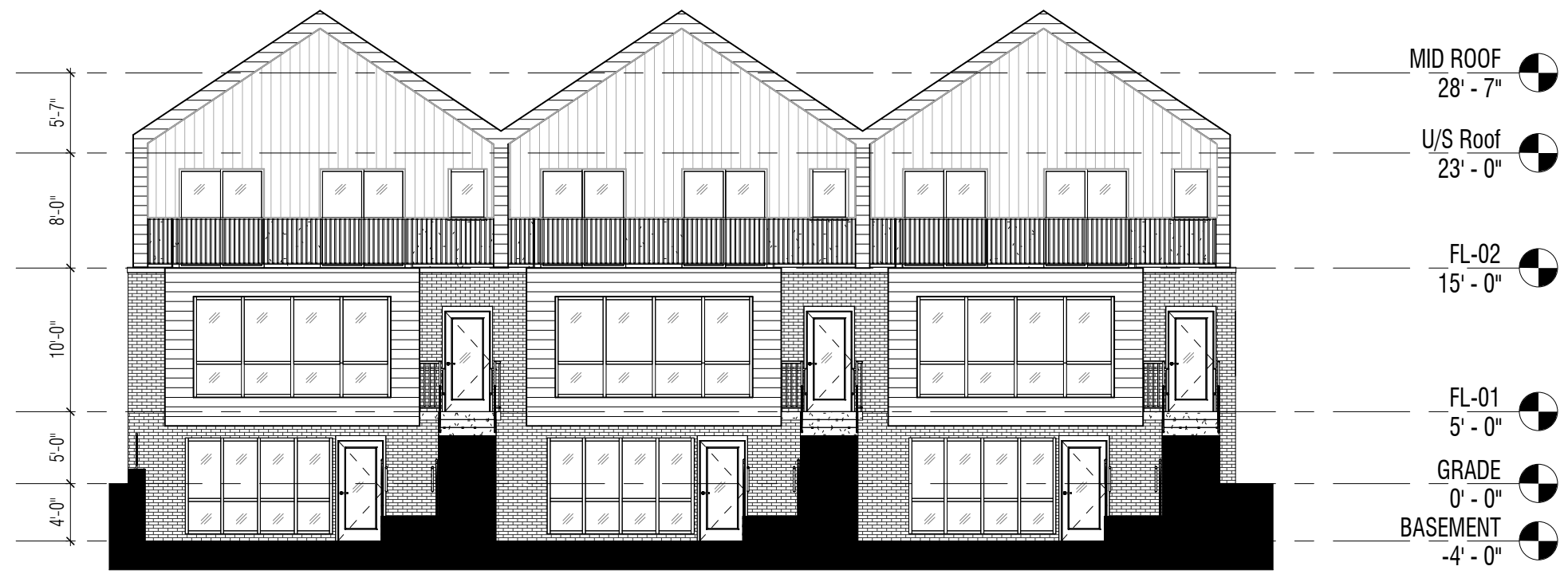
2 SOUTH ELEVATION SK5 3/32" = 1'-0"