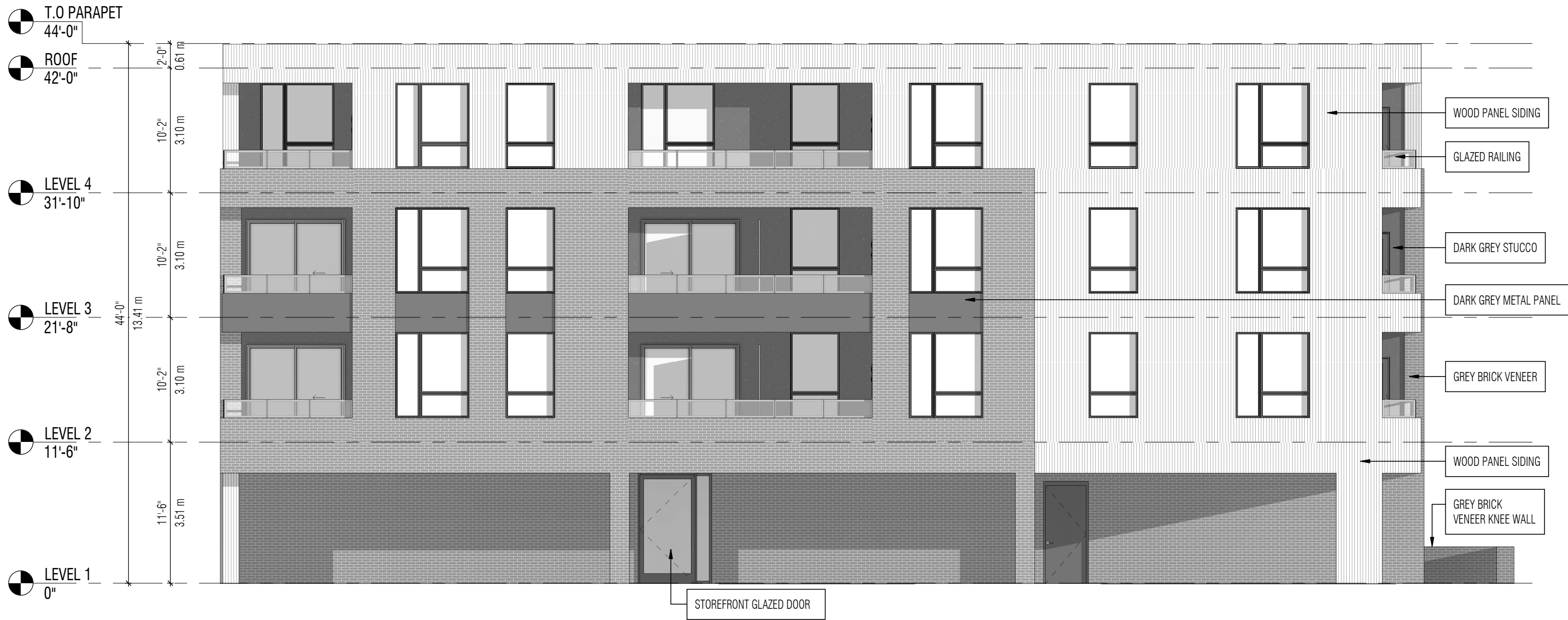
EAST ELEVATION CONCEPT 1/8" = 1'-0"