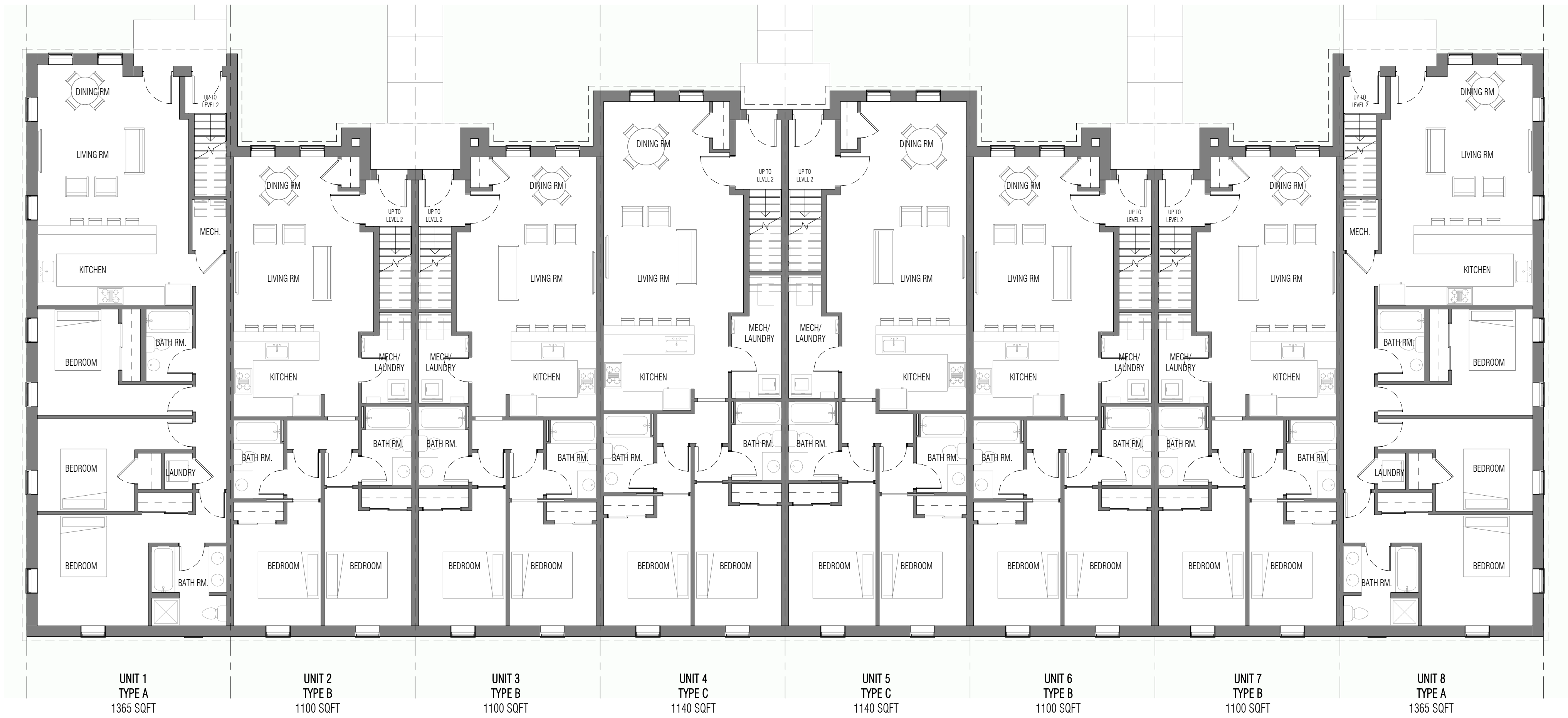
1 FIRST FLOOR PLAN FP01 1/8" = 1'-0"