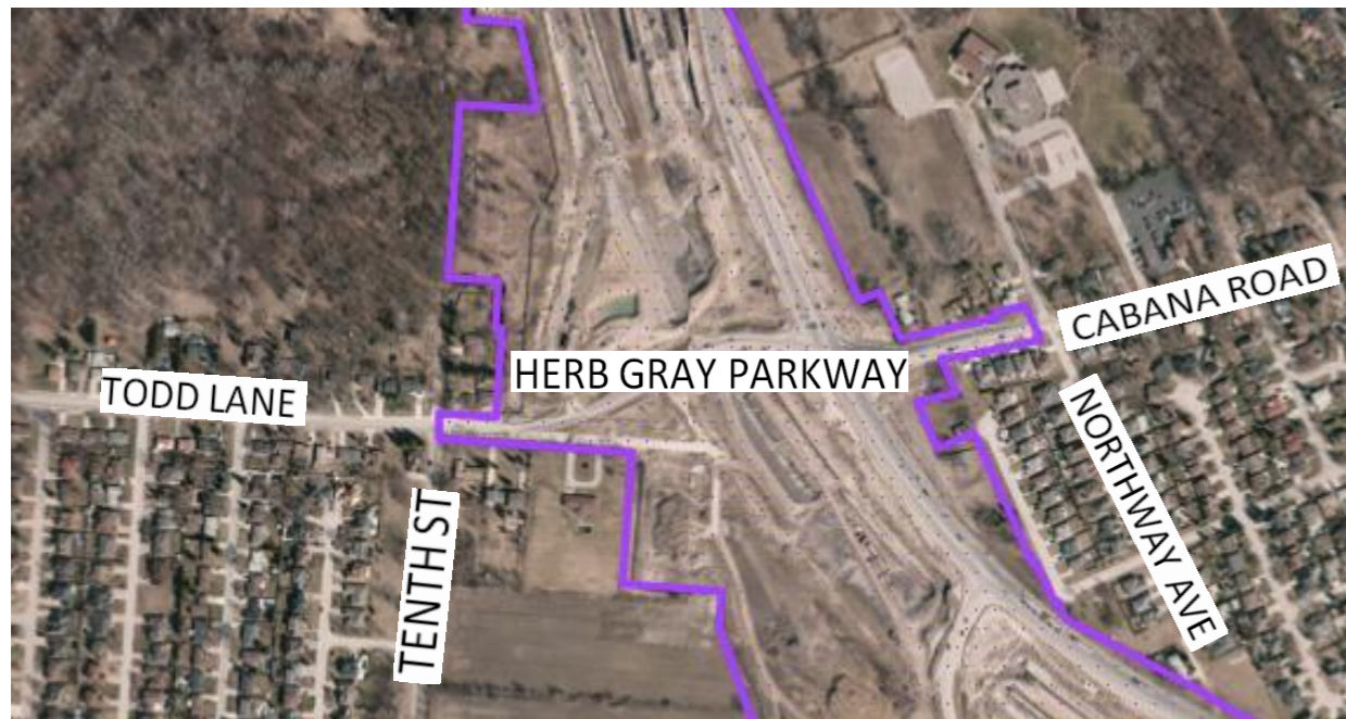
MTO-Assumed Right of Way

Bike Lanes and a Multi-Use Trail on the south side of Todd Lane, from Tenth Street westerly.