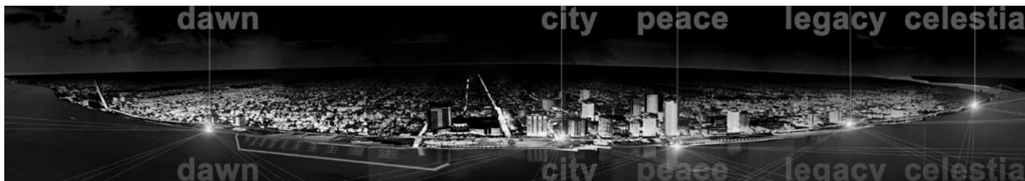
Beacons along the water. Collectively, the Beacons create the Central Riverfront's primary orientation system and identity feature

The Beacons: Five beacons are proposed which explore themes intended to provoke contemplation of time: past, present and future, and to provide a series of destinations where hospitality services such as washrooms, refreshment and information services are located.