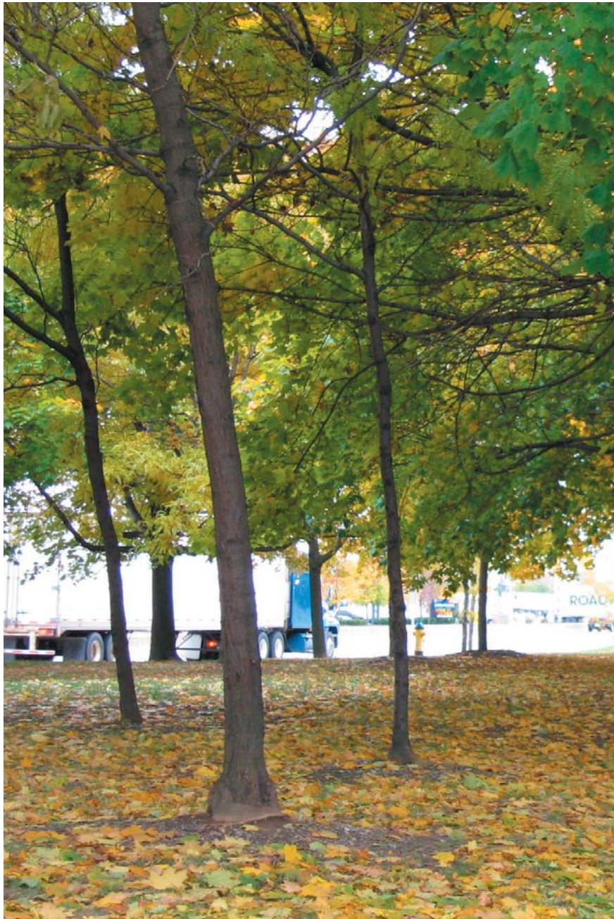
View of existing greenbelt along the western side of Huron Church Road

Road, including lighting, planting, walkways, signage, public art, furniture, and property development.