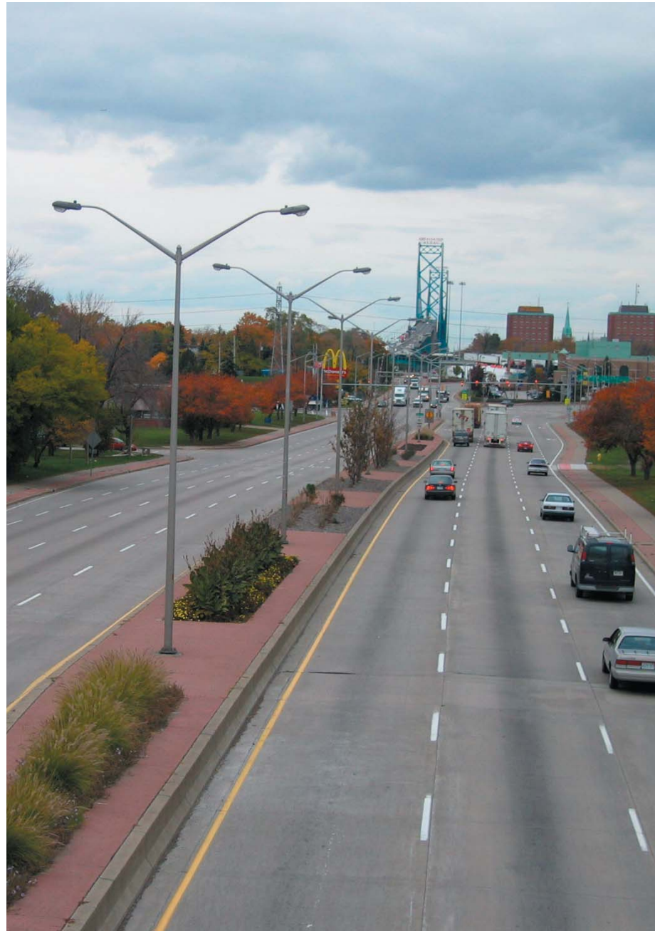
View from Green Pedestrian Bridge looking North along Huron Church Road towards College Ave.