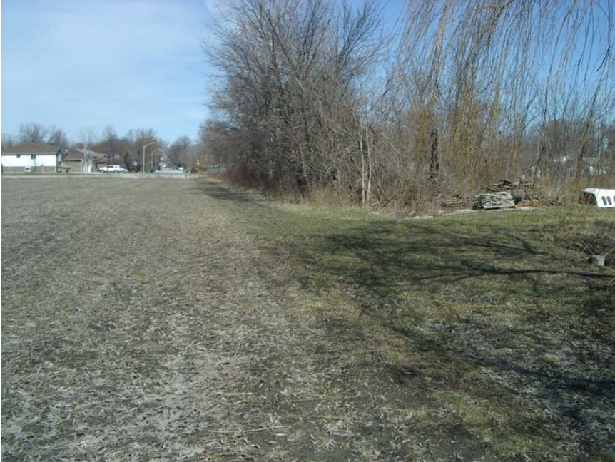
Photo 5 - View looking north, along east property limit.