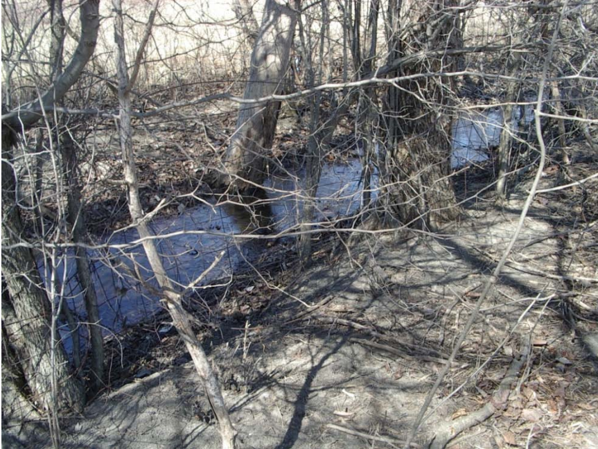
Photo 3 - View of ditch on west property line.