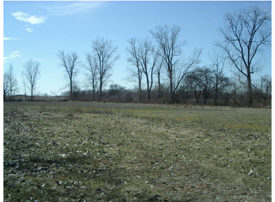
Photo 2 - View looking towards southwest corner of property, from former yard area.