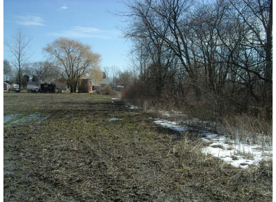
Photo 4 - View looking east along south property boundary.