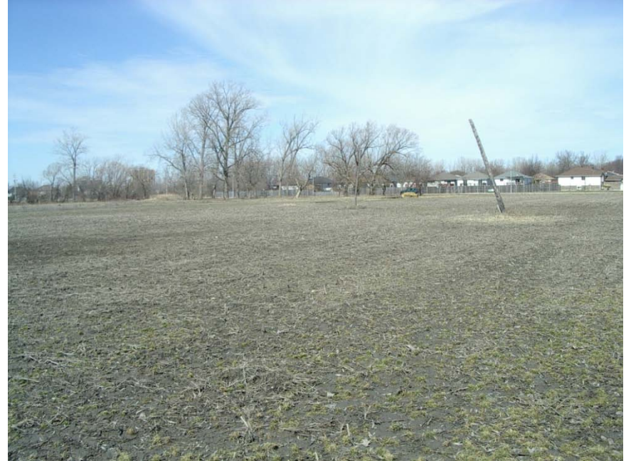
Photo 6 - View looking northwest, towards former yard area.