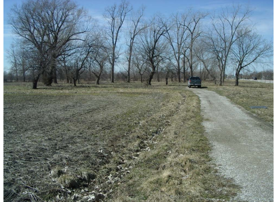
Photo 8 - View looking west, towards former yard area.