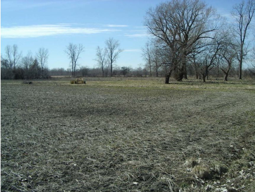
Photo 7 - View looking southwest across property, from the northeast corner.