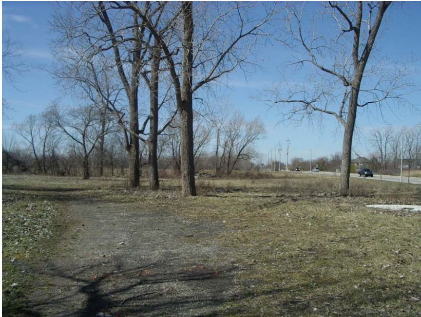
Photo 1 - View looking west along Wyandotte St E, from former yard area.