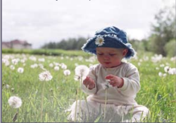
Standing Committee on Environment and Sustainable Development report on pesticides. May 16, 2000

“To home owners and residents of urban and rural areas we say dandelions are harmless and beautiful. They do not pose a threat to health; herbicides do, particularly to children.”