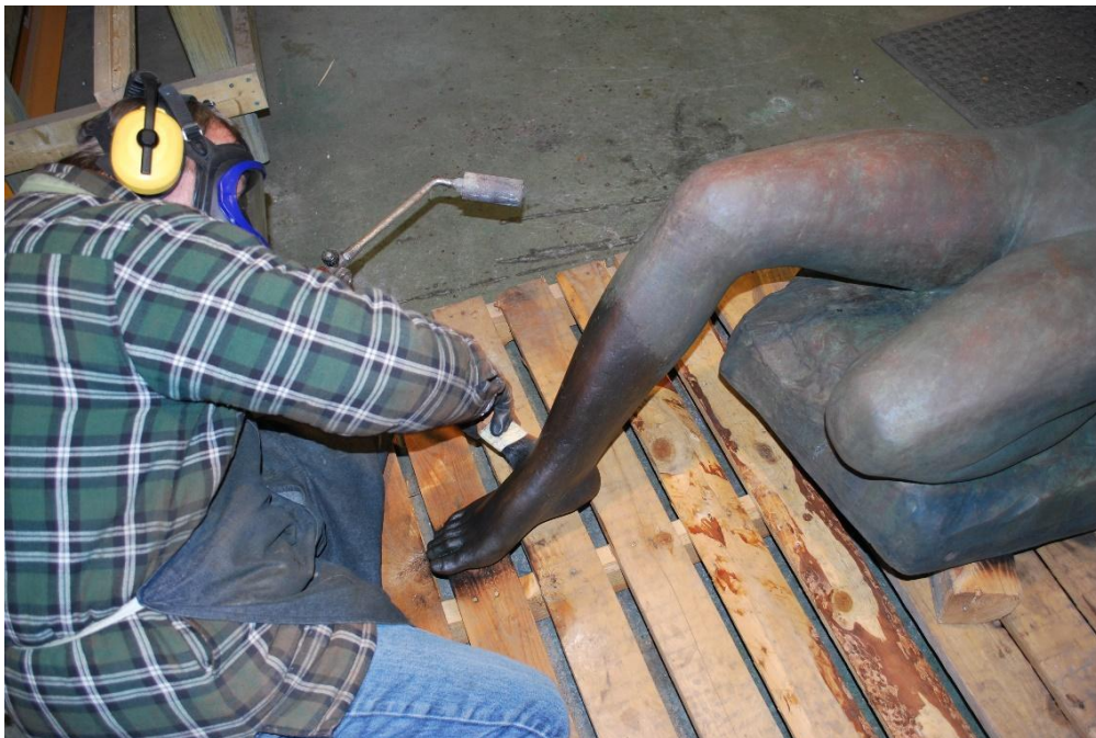
During Treatment - Hot waxing patinaed surface