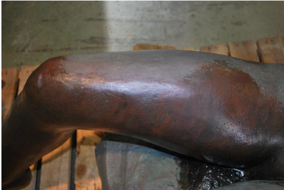
During Treatment - Detail shows richness & depth of patina