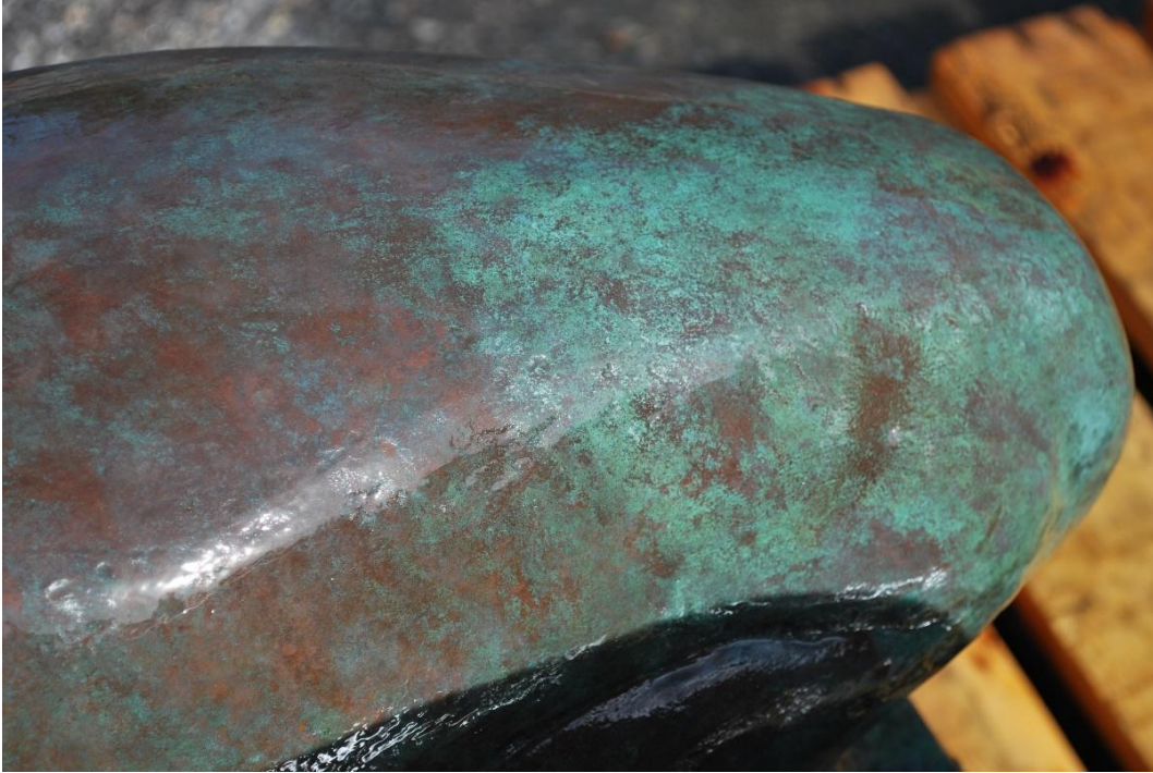
During Treatment – Darker areas denote corrosion removal using pressure washing