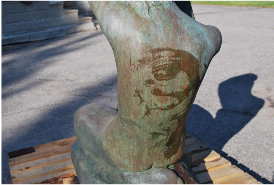
During Treatment - Patina being applied