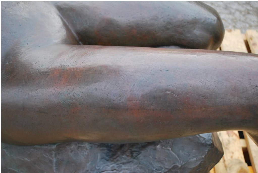
After Treatment – Detail of patina