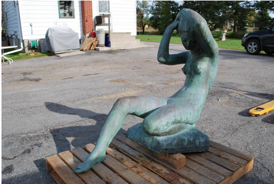
Before treatment - Heavily corroded surface