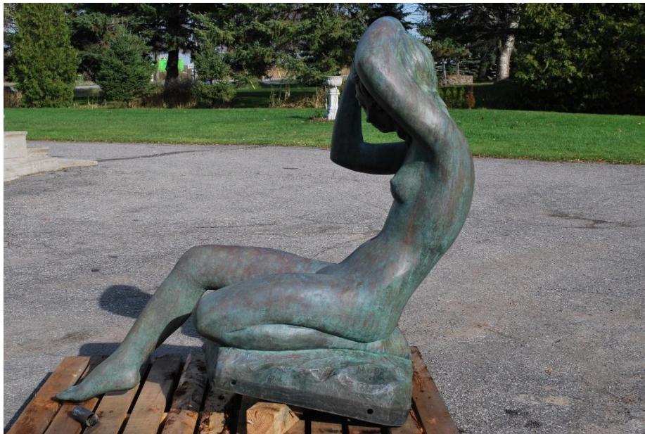
During Treatment - After pressure washing, before patina application