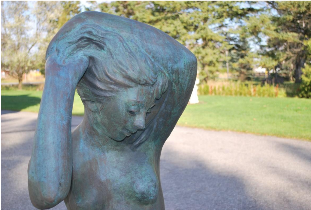
During Treatment – After pressure washing