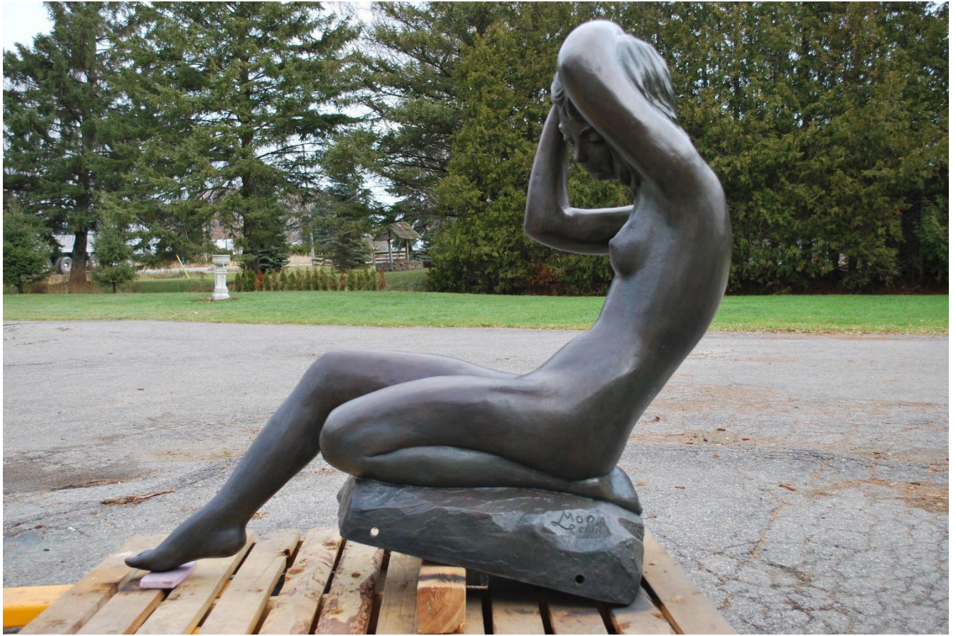
After Treatment - Patina restoration complete