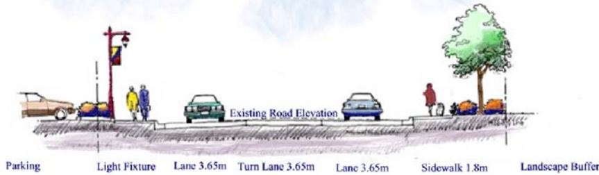
Section C - 'C' North Precinct- Walker Road @ Ontario Rd.