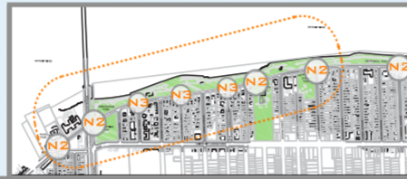
SSIA.1 WEST END

SSIA.1 West End – the western Gateway to both Riverside Drive and downtown that includes the Canada / US Ambassador Bridge with an established open space network and formal parks with views and access to the Detroit River