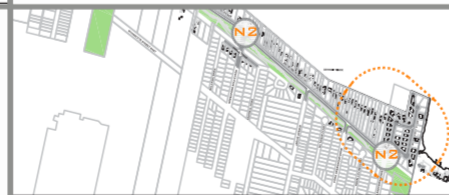
SSIA.5 EAST END

SSIA.5 East End – the eastern gateway to Riverside Drive and established residential district adjacent to the neighbouring Town of Tecumseh.