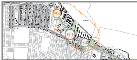
SSIA.1 LAKEVIEW PARK MARINA

SSIA.3 Walker Road – also known, as Walkerville a historic distillery district home to most notably Hiram Walker & Sons Brewing Company, the producers of Canadian Club Whiskey.