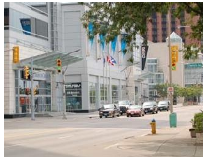
QUELLETTE AT RIVERSIDE