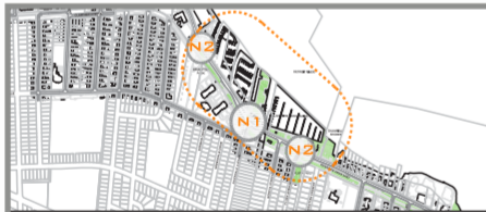
SSIA.4 LAKEVIEW PARK MARINA

SSIA.3 Walker Road – also known, as Walkerville a historic distillery district home to most notably Hiram Walker & Sons Brewing Company, the producers of Canadian Club Whiskey.