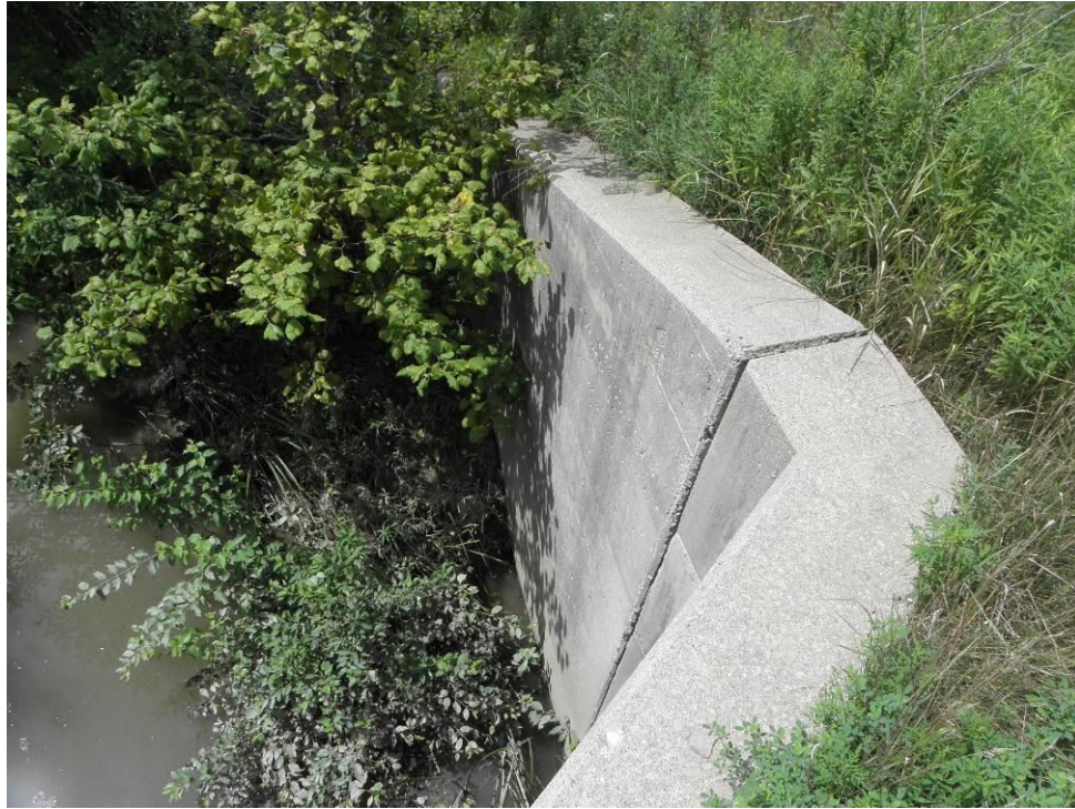
Photograph C9. Northwest retaining wall. Typical condition at each corner of the culvert.