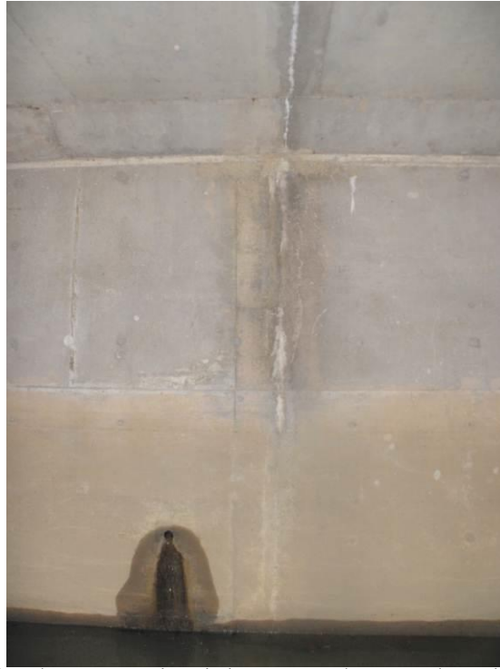
Photograph C13. Stained construction joint. Noted at two locations within the culvert. Photograph shows the typical condition.