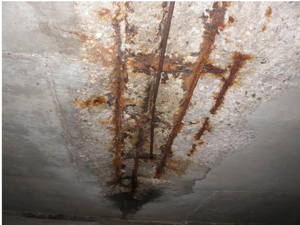
Photograph B16. Very severe concrete spalling. Note the corroded and broken reinforcing steel bars. Looking along the longitudinal direction. Located near the centre.