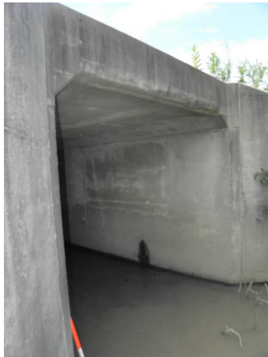
Photograph C8. East elevation.