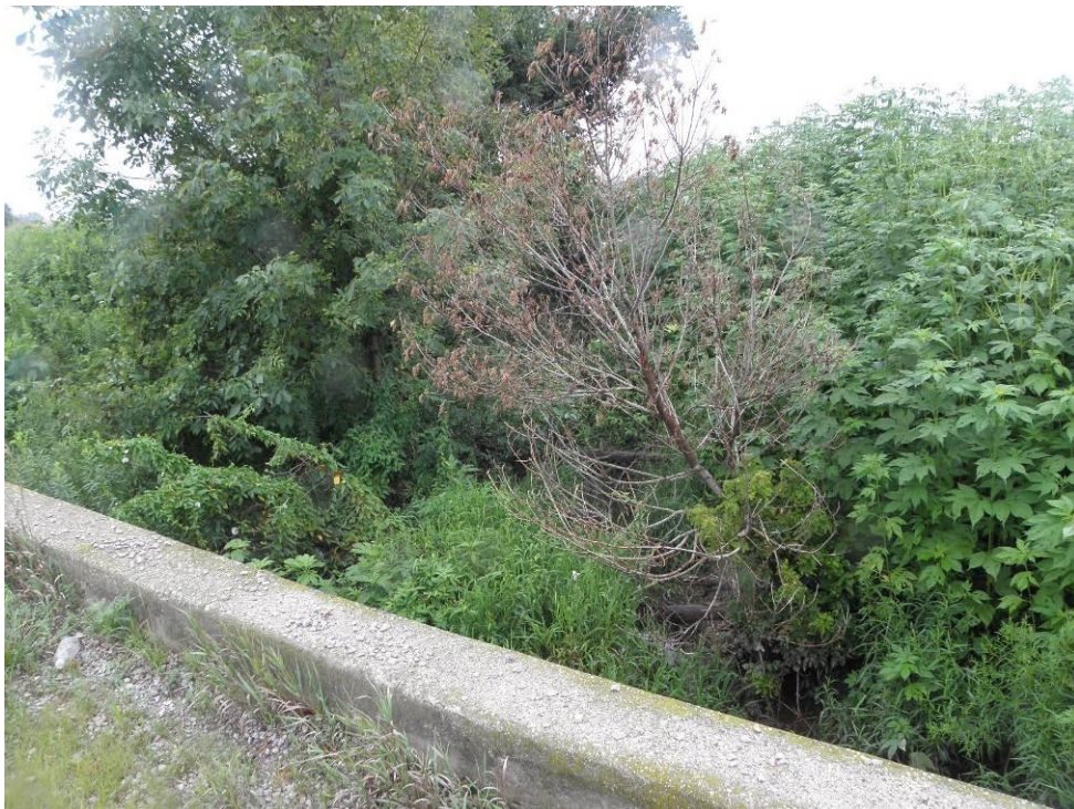
Photograph B6. Looking west from the culvert.