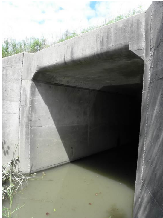
Photograph C7. West elevation.