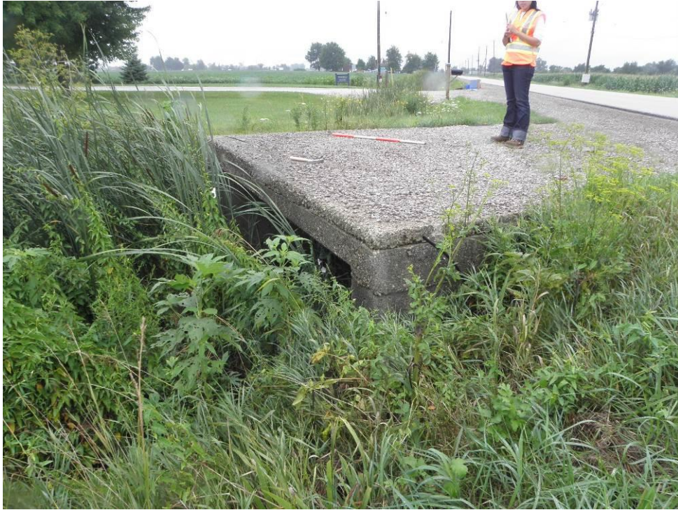
Photograph B3. East elevation.