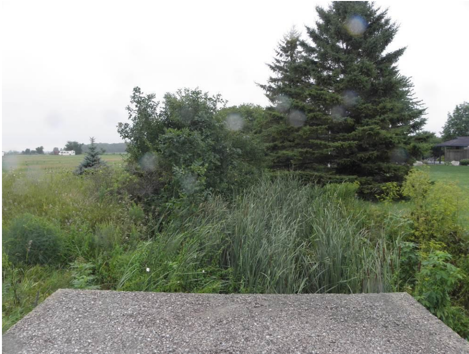
Photograph B5. Looking east from the culvert.