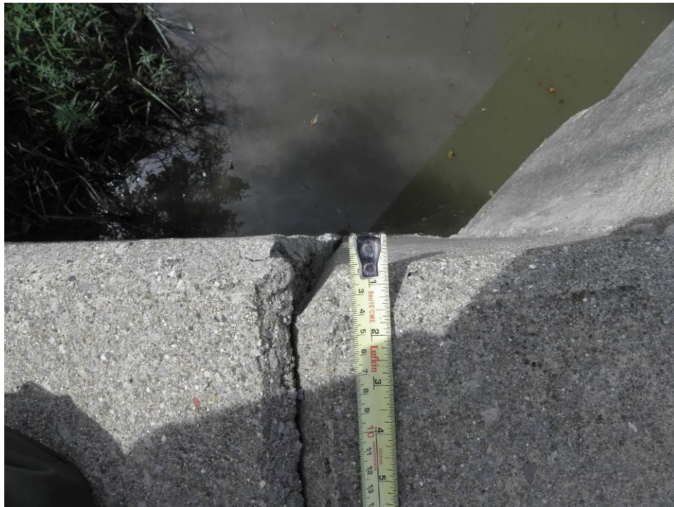
Photograph C10. Southwest culvert corner on the right side and southwest retaining wall on the left side. Note the outward rotation of the retaining wall.