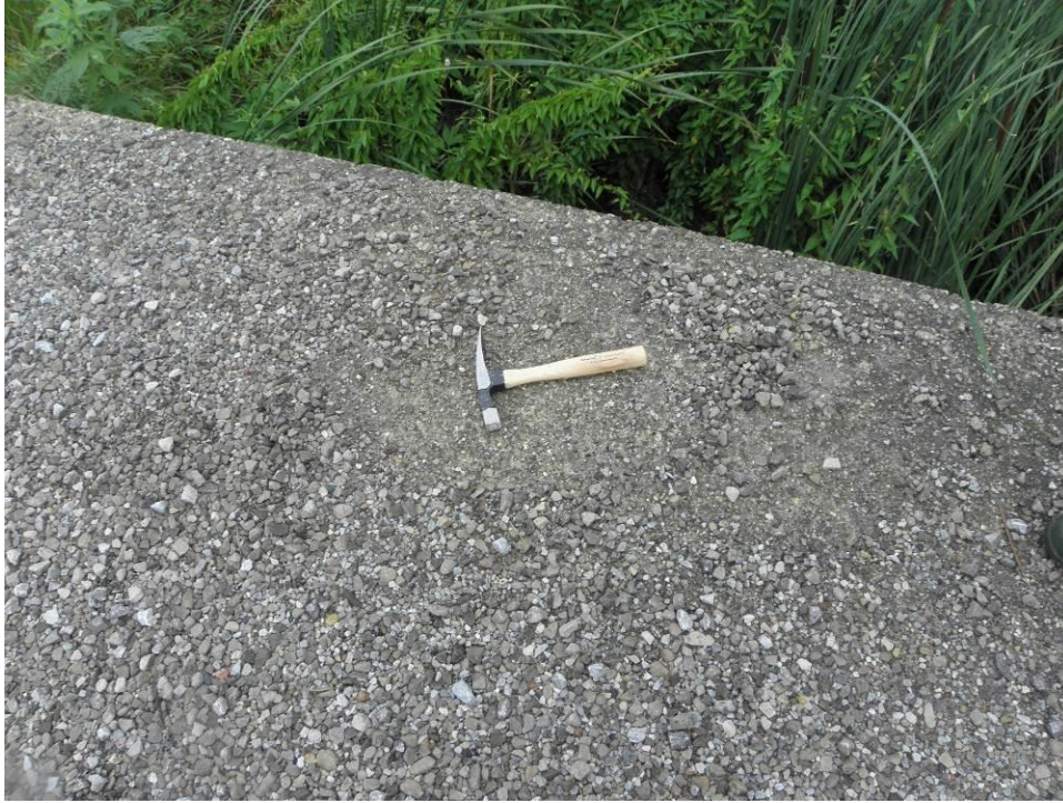
Photograph B7. Exposed top slab of culvert at the east end. Note the medium concrete scaling.