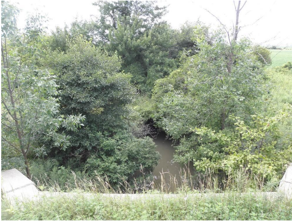
Photograph C5. Looking west from the culvert.