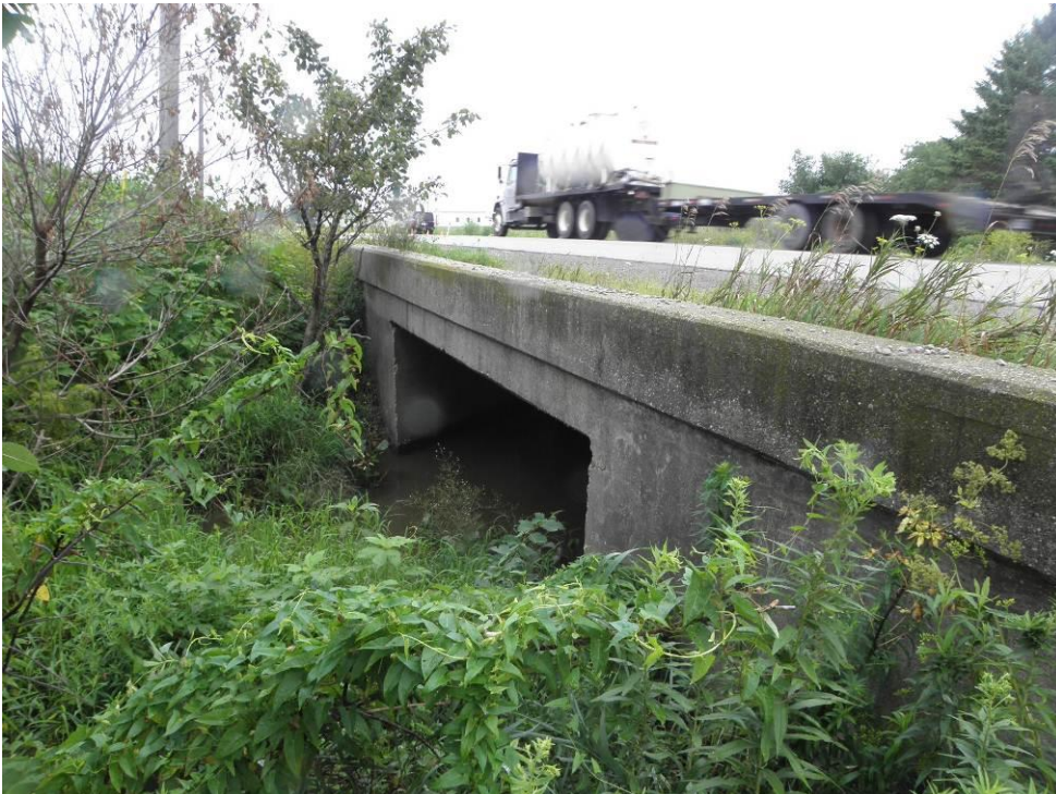
Photograph B4. West elevation.