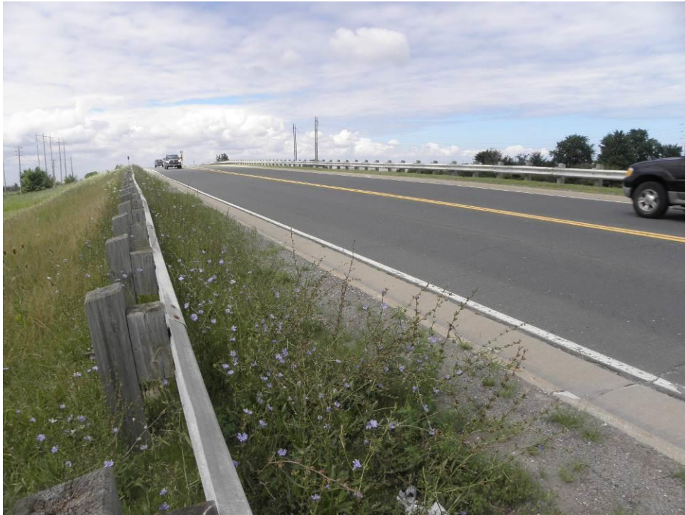
Photograph C1. Looking north from culvert along Lauzon Parkway.