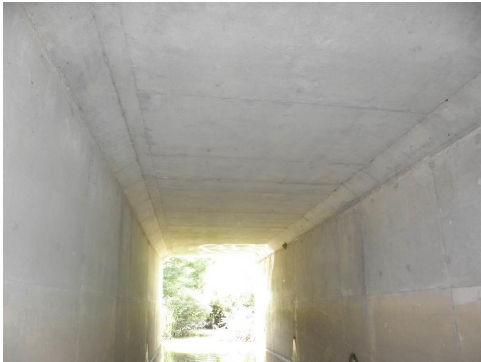
Photograph C12. Looking west through culvert.