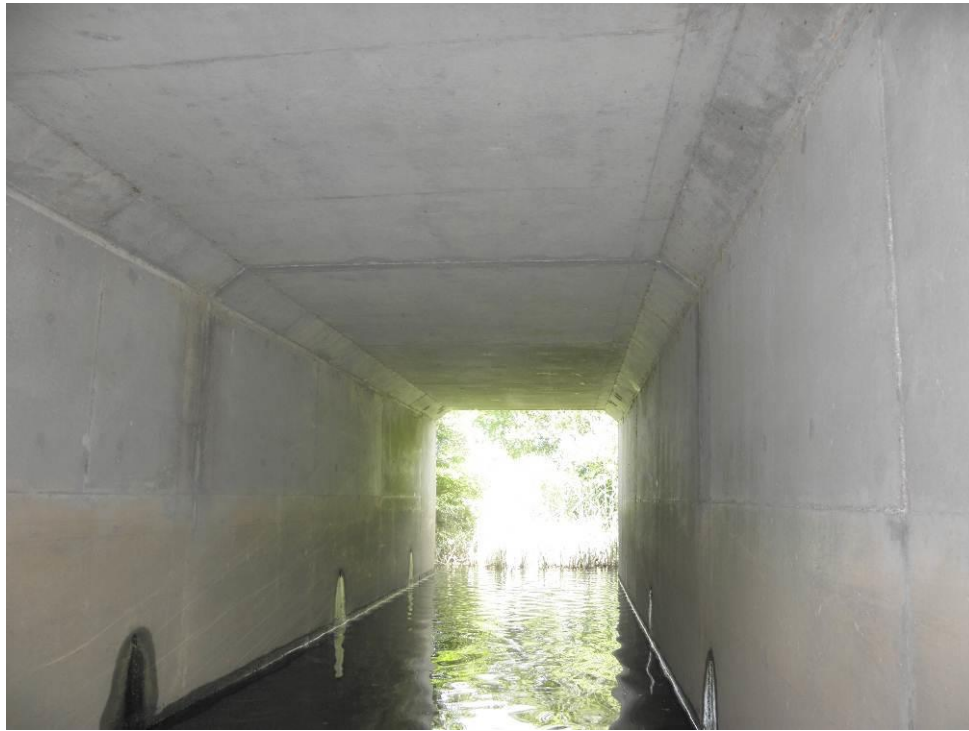
Photograph C11. Looking east through culvert.