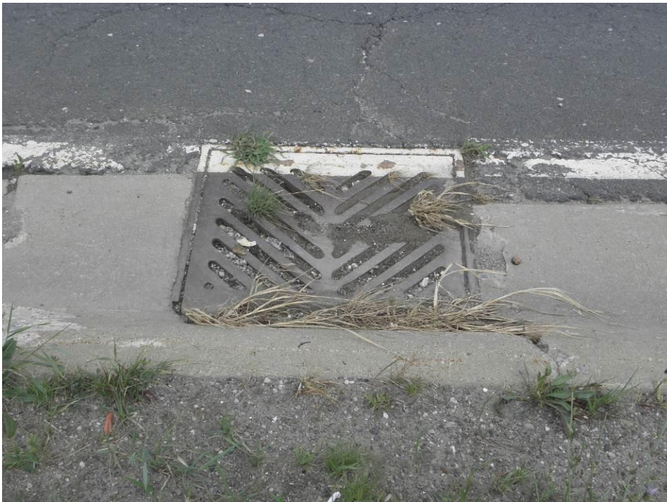
Photograph C4. Catch basin filled with debris. The catch basin is located along the west curb of Lauzon Parkway just a few metres south of the culvert.