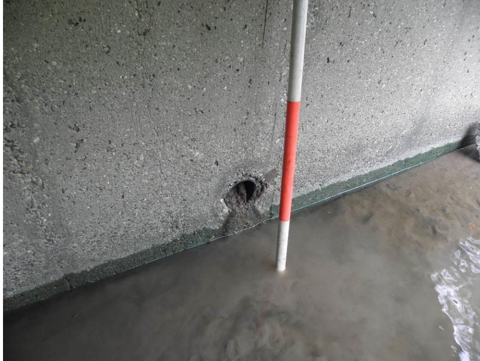
Photograph B13. Wall drain. Typical condition. Note the sediment build-up within the pipe.