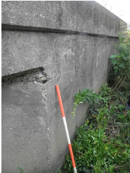
Photograph B8. Southwest wingwall. Note the minor honeycombing.