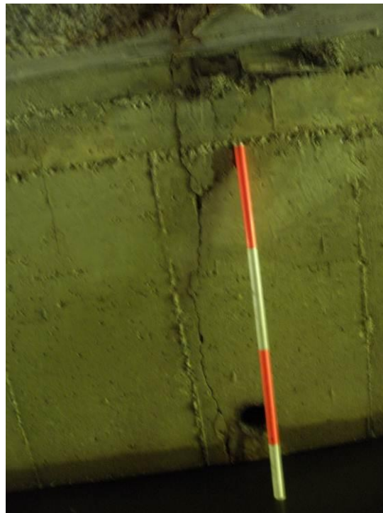
Photograph B14. Wide vertical crack within the south culvert wall. Similar crack was noted in the north culvert wall. Both are located near the centre of the culvert.