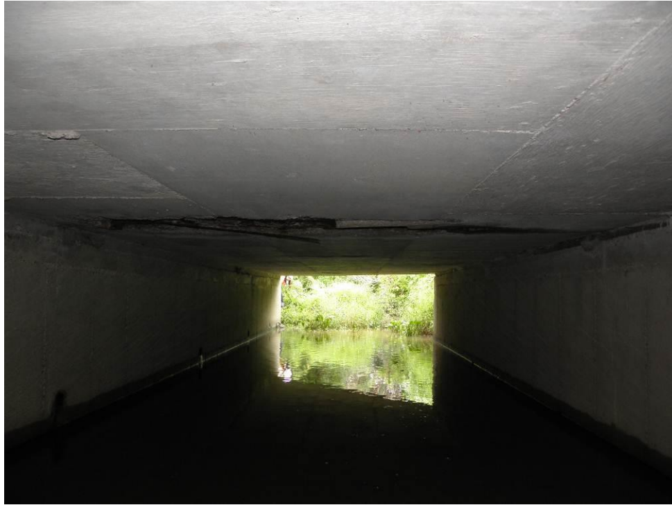
Photograph B9. Looking west through the culvert. Note the very severe spall in the top slab.