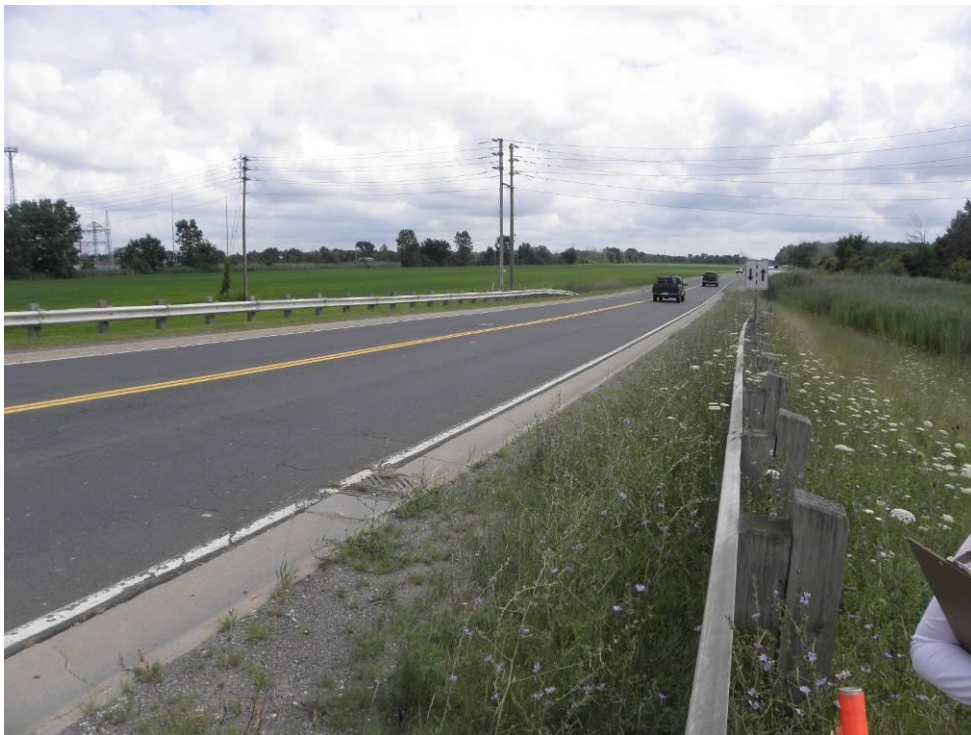
Photograph C2. Looking south from culvert along Lauzon Parkway.