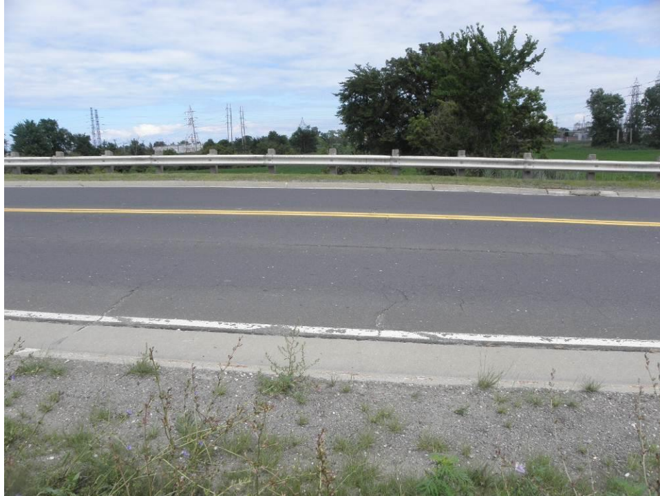
Photograph C3. Looking east across Lauzon Parkway. The culvert is directly below in the photograph.