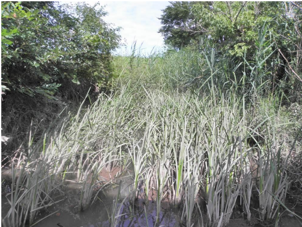
Photograph C6. Looking east from the culvert.