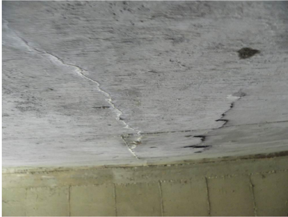
Photograph B15. Very severe concrete delamination in culvert soffit.