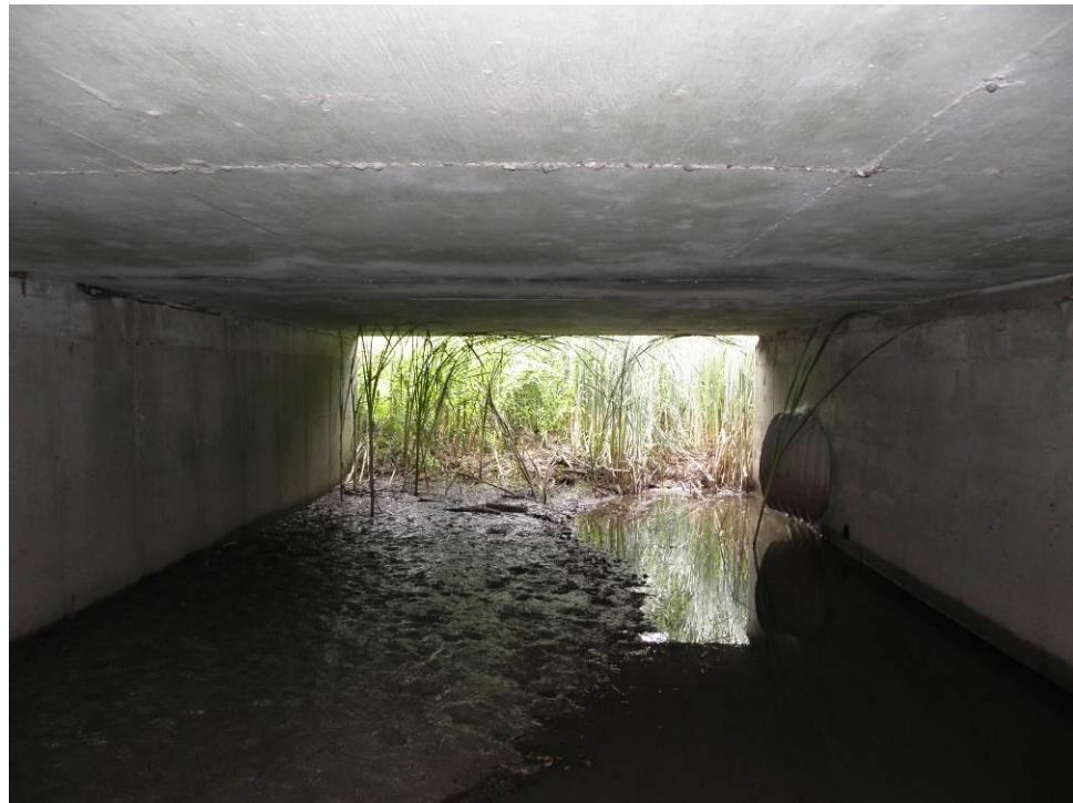
Photograph B10. Looking east through the culvert.