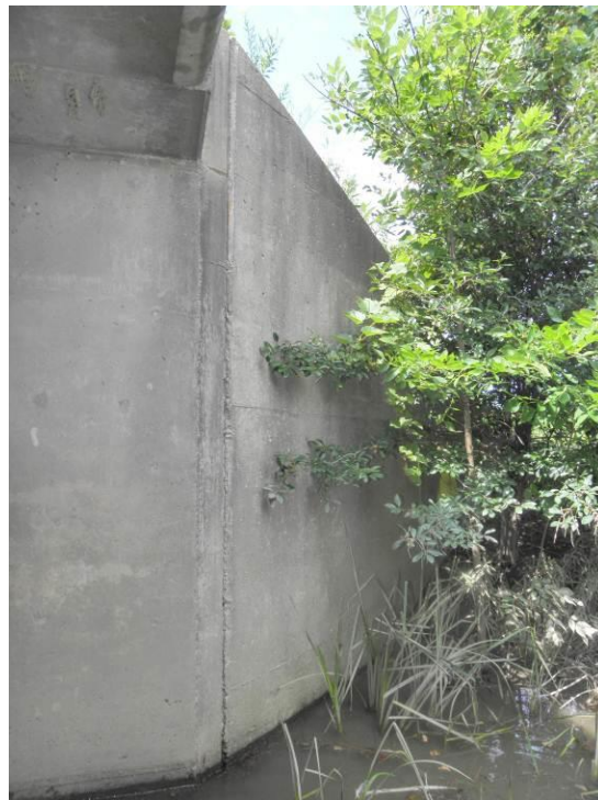
Photograph C16. Northeast wingwall.