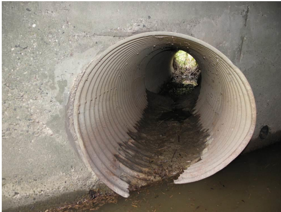
Photograph B12. Drainage ditch CSP through south culvert wall near the east end of the culvert. Note the perforations in the bottom and distorted shape.