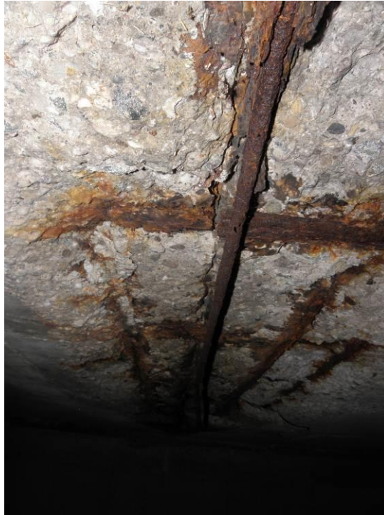
Photograph B17. Close-up view of the previous photograph. Note the longitudinal concrete crack within the top slab.