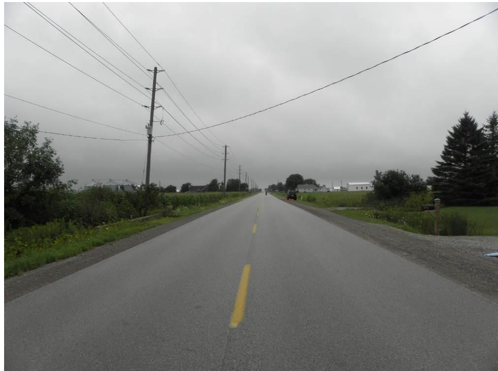
Photograph B2. South approach, looking north along 10 th Concession Road.