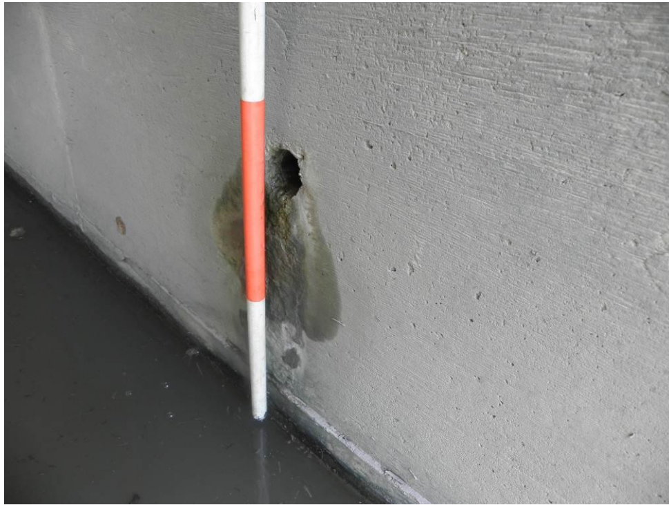
Photograph C15. Wall drain. Typical condition.