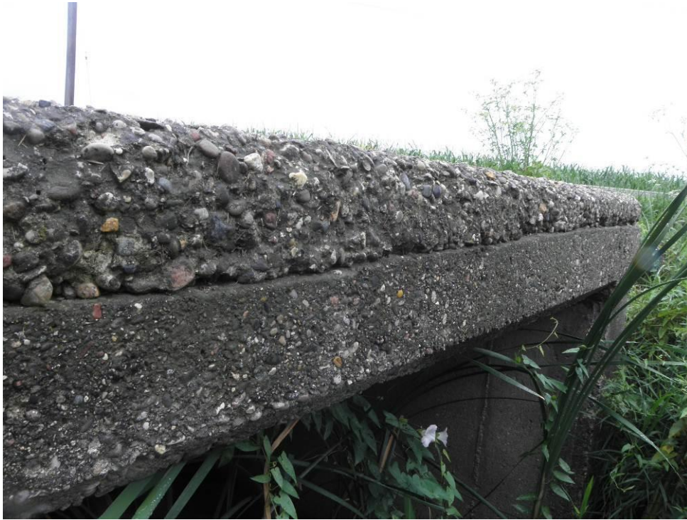
Photograph B11. East end of culvert. Note the medium concrete scaling of the top slab.