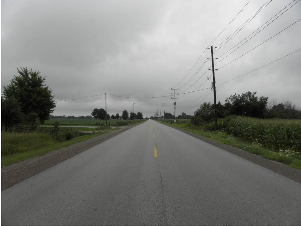
Photograph B1. North approach, looking south along 10 th Concession Road.