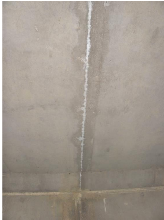
Photograph C14. Stained construction joint. Showing the soffit of the previous photograph.