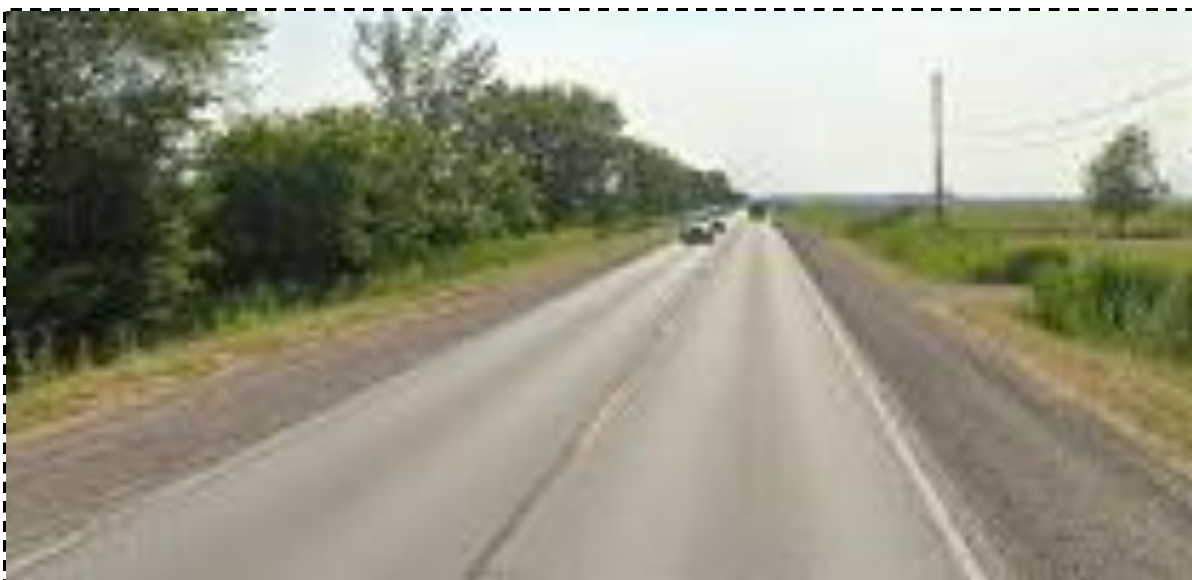
County Rd 42 (Typical Road within Study Area)