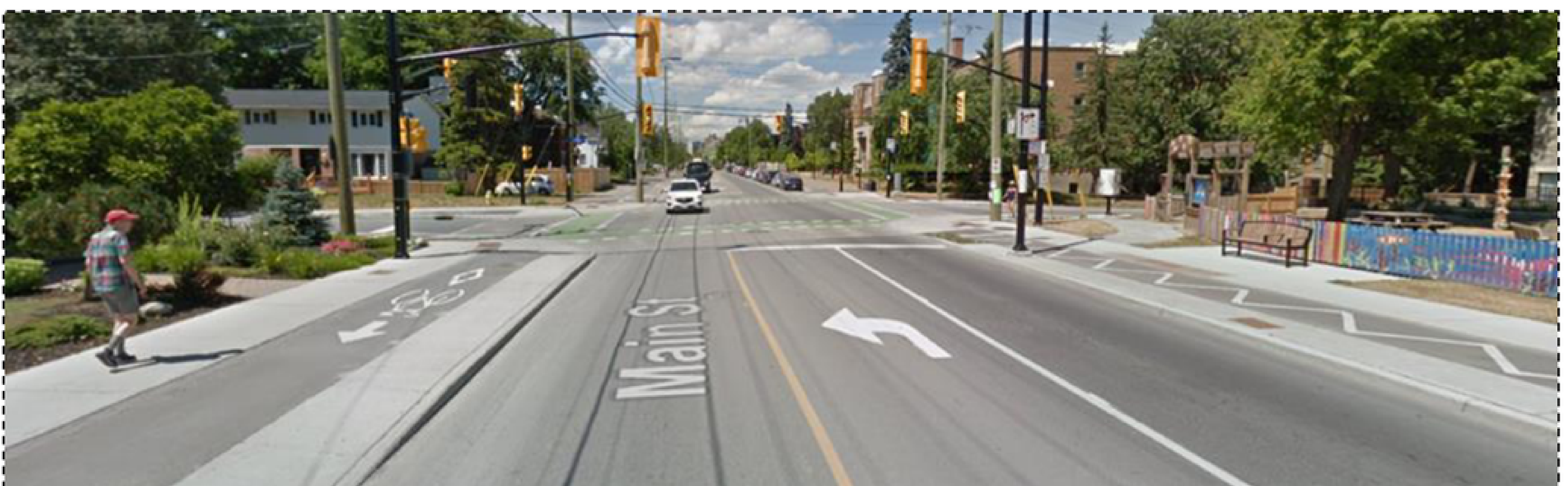
Ottawa, ON (Main St.)