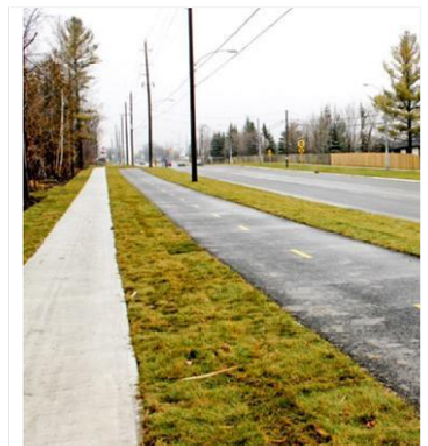
Peterborough, ON (Brealey Dr.)