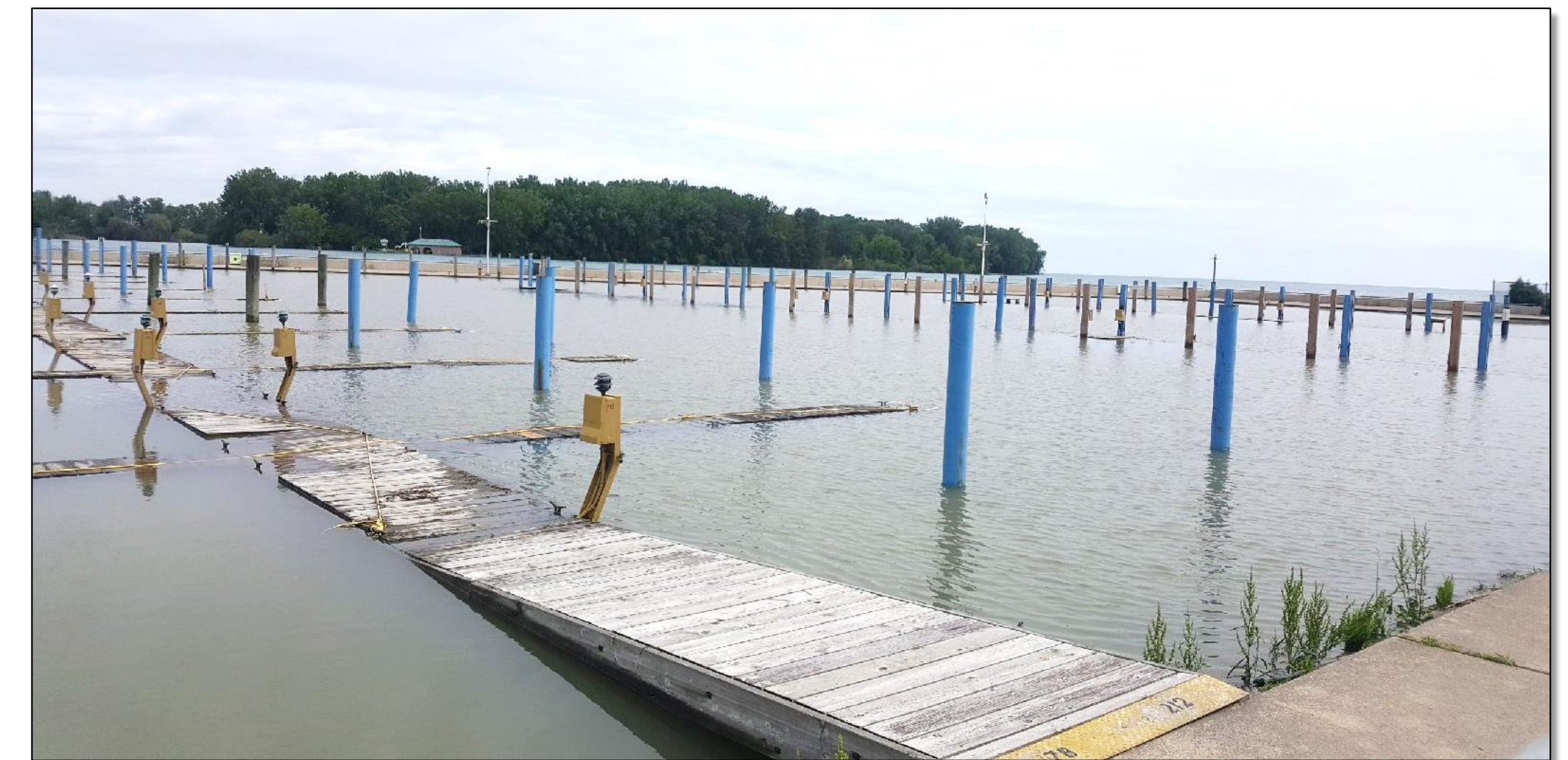
LAKEVIEW MARINA (20 JUNE 2019)

Based on the above, it is clear that significant upgrades to the existing dike system are needed.