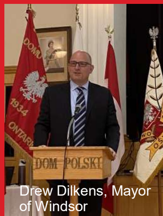
Drew Dilkens, Mayor of Windsor