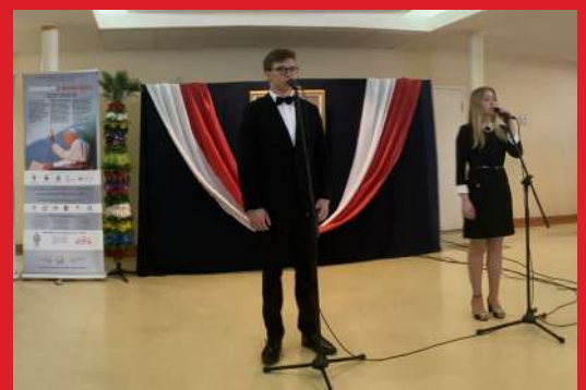
Polskie Nadzieje, vocal group