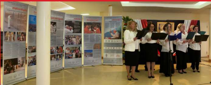
Holy Trinity Church, Choir