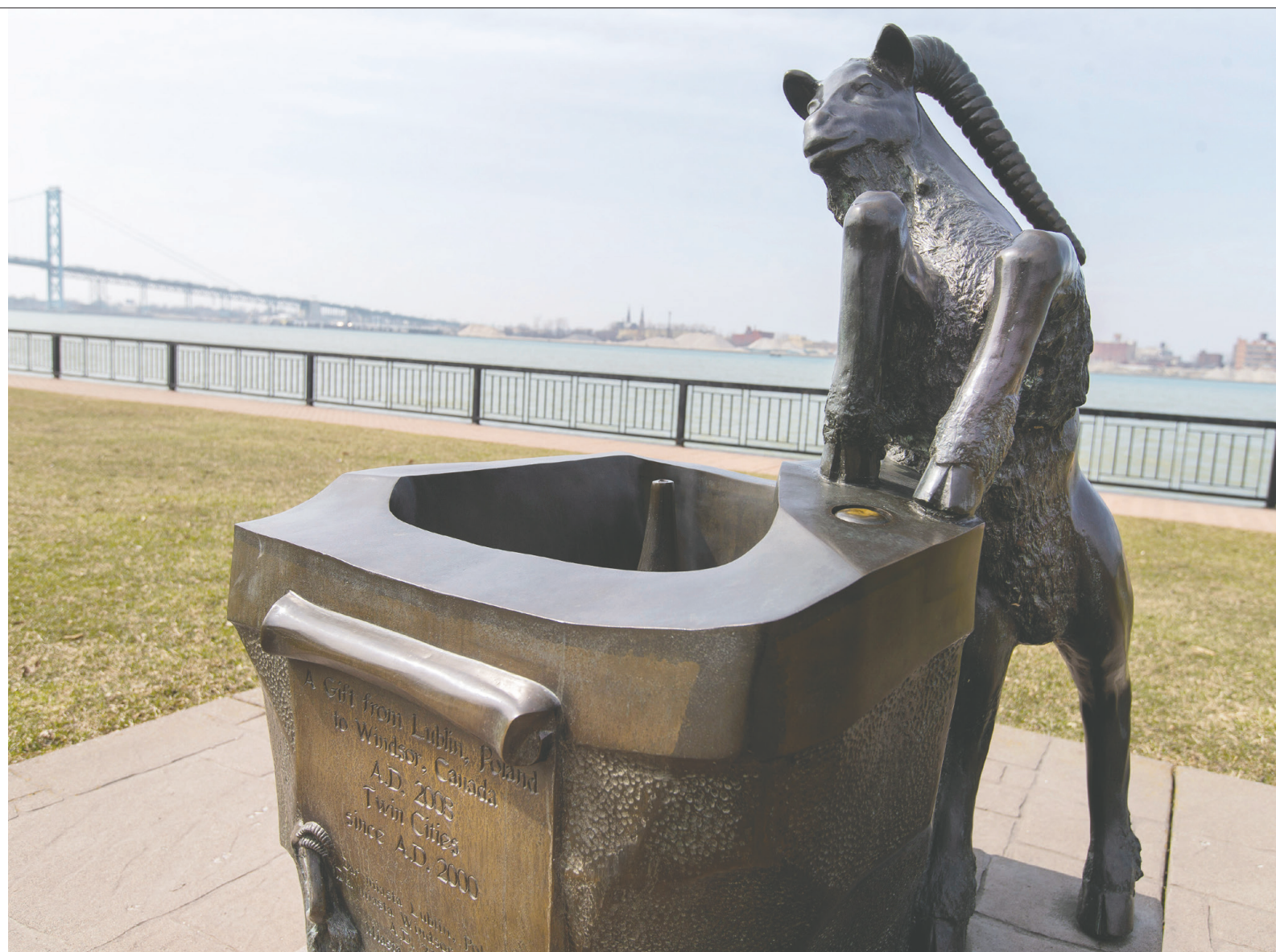
Billy Goat Spring was a gift from Lublin, Poland, to Windsor in 2008 and sits in Centennial Park. The cities twinned in 2000. Lublin is located fewer than 100 kilometres from Poland's border with Ukraine and is the first point of contact for many refugees escaping the war with Russia. DAX MELMER

In an April 5 story on A1 of the Windsor Star, "New transmission line projects announced for Southwestern Ontario," a Hydro One spokesperson misstated the date when the first of the announced transmission lines will be operational. The Chatham to Lakeshore Line is expected to be in service by the end of 2025, not 2024 as stated by the spokesperson.