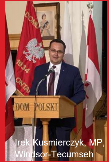
Irek Kusmierczyk, MP, Windsor-Tecumseh