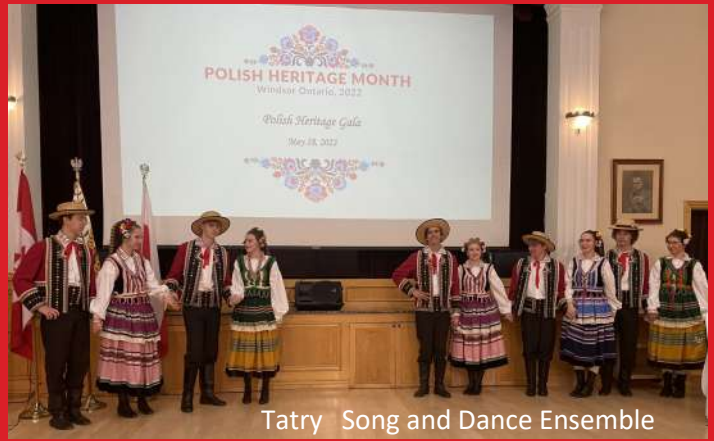
Tatry Song and Dance Ensemble