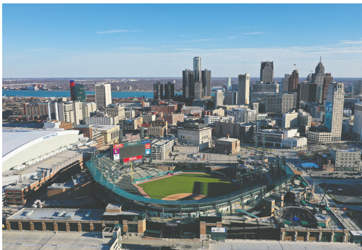
Tailgaters will set up around downtown Detroit and Comerica Park early Friday.

If you're going, it's probably a good idea to bundle up and bring an umbrella. InEnvironment Canada is forecasting 10C on Friday with a 60 per cent of rain. And you'll have to find your own transportation.