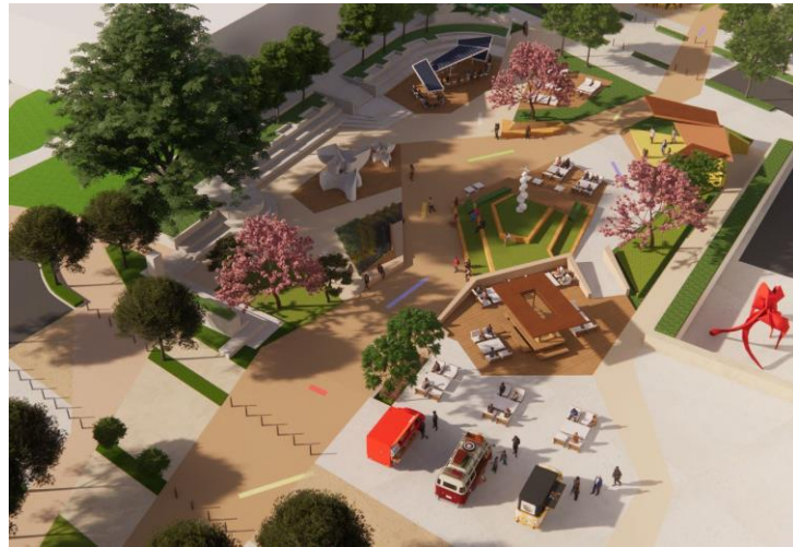
Figure 5: Aerial View of Segment 2 Charles Clarke Square

Charles Clark Square responds to the highly important priority of a flexible space for larger gatherings that also serves the community, nearby office workers and City staff, and residents. Like in Arts Park, paving patterns form creative geometric plazas and spaces that function as outdoor rooms, and can combine to host events. A stage with canopy and tiered planter invite performances while providing sheltered seating.