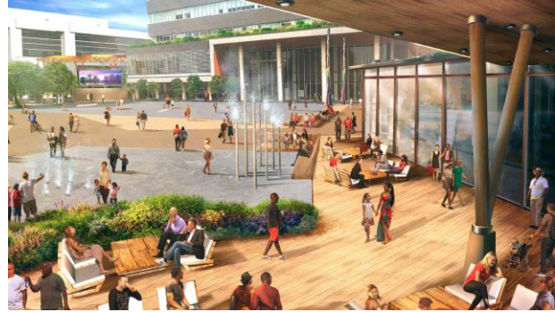
Figure 2: City Hall Plaza Perspective

Key to the success of City Hall Square is the relocation of the Charles Clark Square ice rink. A temporary feature operating during the winter months, the new rink takes advantages of significant advances in ice and rink technology and construction in recent years.