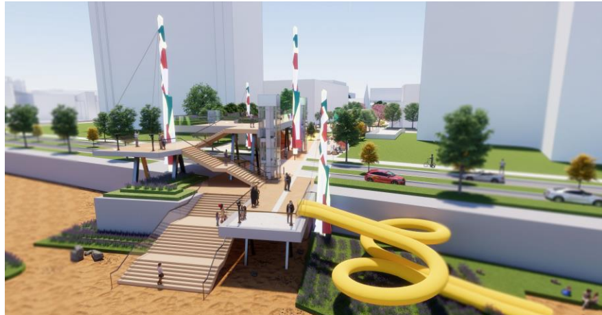
Figure 9: Riverside Dr Bridge Crossing Option

At Riverside Drive, a raised, signalized crossing extends the plaza toward the River, creating a safer crossing experience. A tiered overlook reflects the former design of the “City Beacon”, imagined in the Riverfront Master Plan but never