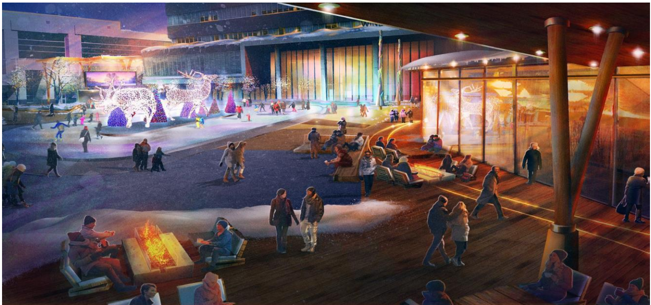
Figure 4: City Hall Plaza Winter Perspective with Temporary Ice Rink

The rink will be in the form of a skate trail, with a center island to discourage hockey and allow for seasonal displays. Portable curbs are frozen in place for stability and fully accommodate a Zamboni. The curbs are stored in the off-season in the nearby pavilion, along with the Zamboni. Freezing mechanism/rink pipes are encased in concrete below the paving and are indistinguishable during the summer months.