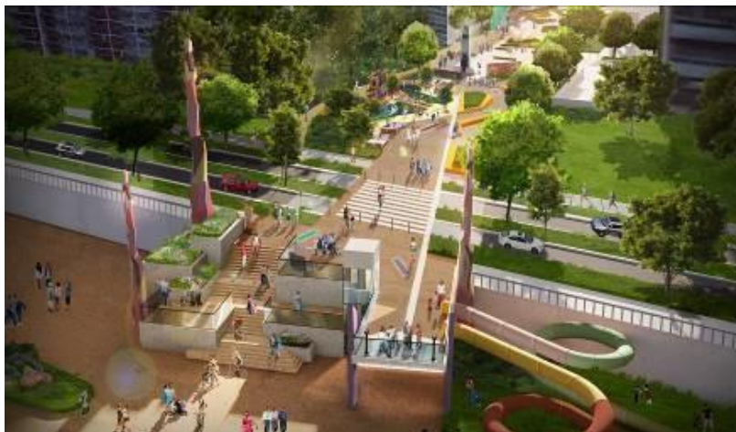
Figure 8: Riverside Drive at Grade Crossing Option

This segment of the Esplanade begins and ends with a celebration of the remarkable history of the Underground Railroad on the site. Twin monuments in Windsor and Detroit, the Tower of Freedom and Gateway to Freedom, tell the harrowing stories of Black Freedom Seekers who came to Canada escaping slavery in the US. The two monuments are connected by an invisible line established at the time of construction by global coordinates. This line is “brought to light” extending from the Tower of Freedom to an overlook pointing directly toward the Gateway monument on the Detroit side. Telescopic viewers and interpretive signage allow visitors to see and understand the Detroit monument and the close relationship between the two cities. This layout is one of the important storytelling moments that create “Sentinels” –moments in time where