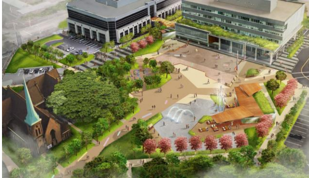
Figure 3: City Hall Plaza Aerial View

In the forecourt of City Hall, the outline of the former military barracks and Black Refugee housing continue the story of the Underground Railroad on the site while providing event space. An adjacent space features an interactive water feature with cooling jets, misting towers and a variety of seating. A new building, the Windsor Beacon, holds F&B vendors, a pavilion for exhibits and operational spaces. A new gateway, relocated Francophone moment and media screen engage visitors and enliven the experience.