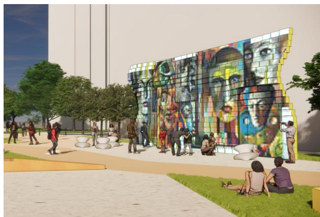
Figure 7: Segment 3 - Interactive Multimedia Wall