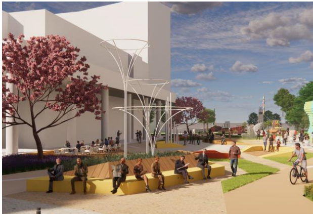
Figure 6: Segment 3 - Sculptural Seating

Referred to as “Arts Park, Segment 3 offers a series of flexible spaces which can be used individually to display permanent or evolving art installations, or combine to serve medium or even larger gatherings and performance. The spaces, paths and plazas are creating by paving colors and patterns with a variety of textures that define spaces without presenting barriers to larger group events. Even the level “turf panels” serve this function, creating green spaces for relaxation that can easily be used as seating for gatherings.